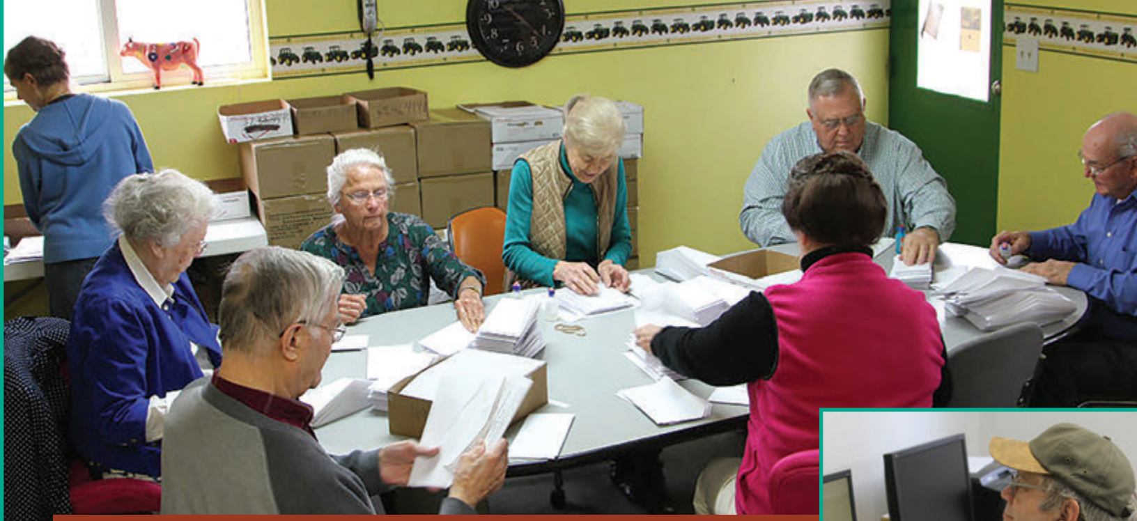
VOLUNTEERS SORTING, SEPARATING AND PREPARING STUDIES TO MAIL