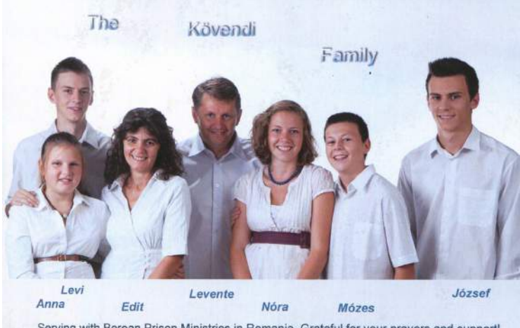
Serving with Berean Prison Ministries in Romania. Grateful for your prayers and support!

Berean has helped with the establishment and